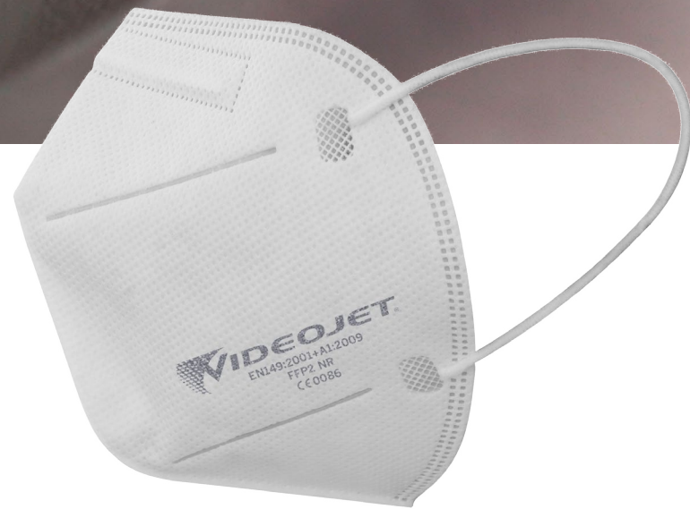
Medical masks (FFP2, FFP3, N95, KN95)